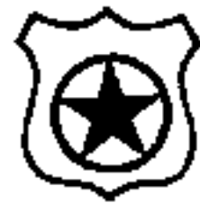
MA - Master-at-Arms