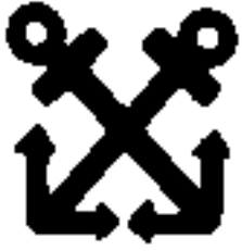
BM - Boatswain's Mate