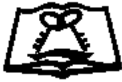
CS - Culinary Specialist