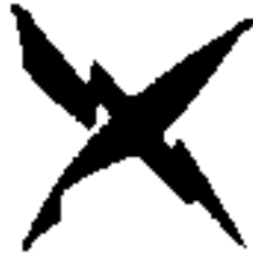
CT - Cryptologic Technician