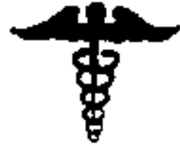
HM - Hospital Corpsman