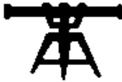
FT - Fire Control Technician