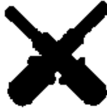
GM - Gunner's Mate