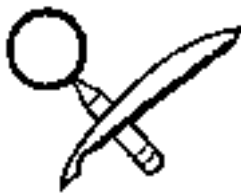
IS - Intelligence Specialist