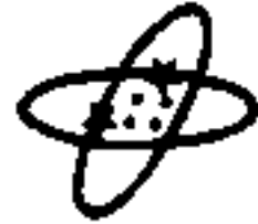
ET - Electronics Technician