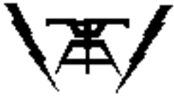
FC - Fire Controlman