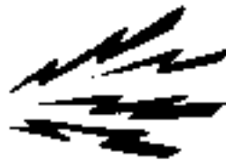
IT - Information Systems Technician